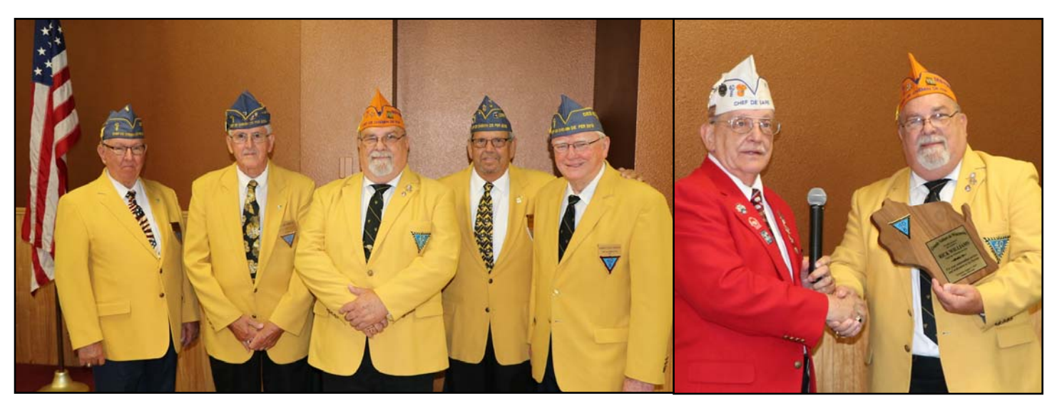
2019 Wisconsin Promenade