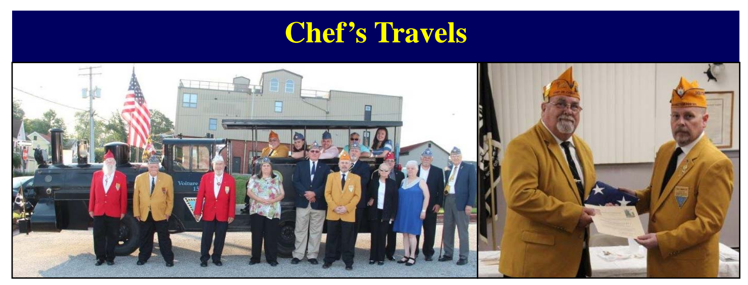
2019 Maryland Promenade