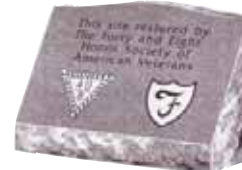
Marker at Cemetery Plot

At the Cajun Wreck (19-23 February) our Committee will decide upon which proposed projects to fund in 2020. As always, the projects will support the museum (equipment, exhibit enhancements, etc.) or the Carville Historic District (the buildings, cemetery, and grounds of Carville). Your pin purchases and donations (Buy-A-Clinic, Buy-A-Country, designated museum or equipment support donations) make our projects possible. We are grateful for your continuing support of our Program. May we all have a great 2020!