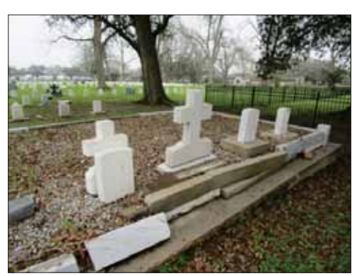
Daughters of Charity Plot

Who are The Daughters of Charity? They are Catholic Sisters known for serving the sick and the poorest of the