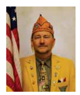
Our 100th Promenade Nationale is quickly approaching and we are encouraging

September 10th, 2019 - September 14th, 2019