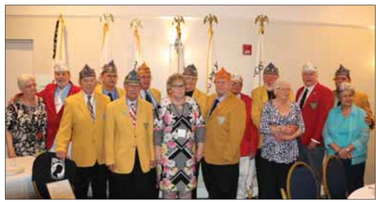
Some of the many Voyageurs and Dames in attendance from Ohio.