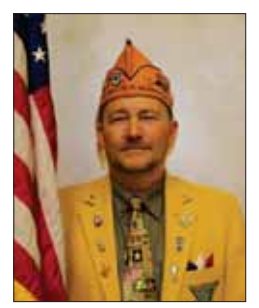
Just a quick note to all the Voyageurs & Dames that have

September 10th, 2019 - September 14th, 2019