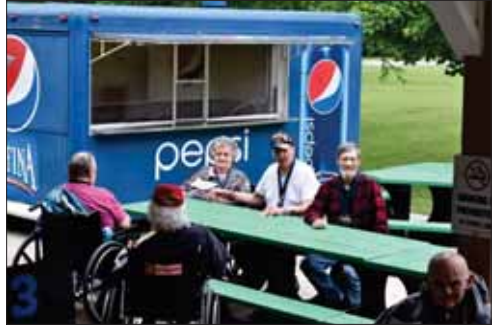
Veterans enjoying the plastic picnic tables.