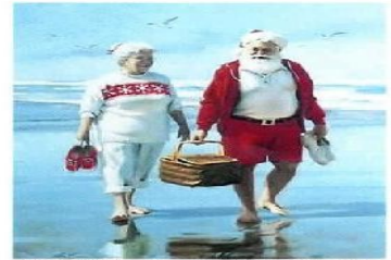
Santa & Mrs. Claus' last day of vacation before preparation for Christmas.

The Marine Toys for Tots Foundation enjoys one of the very best program-to-support ratios within the nonprofit world — 97:3 ! This means that over 97% of your donation goes directly to our mission of providing toys, books and other gifts to less fortunate children. The 3% spent on support principally covers fundraising expenses — not one donated dollar goes to salaries or any manpower costs!