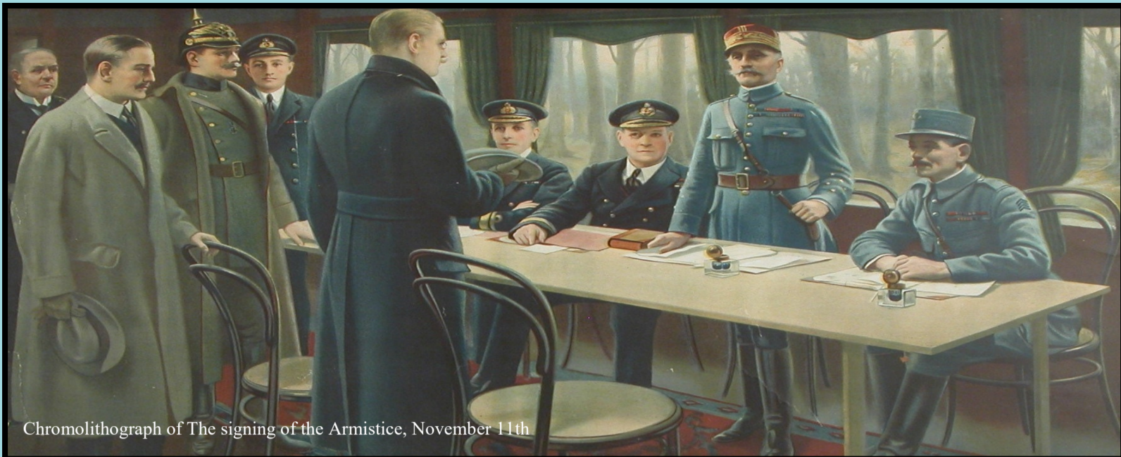
Chromolithograph of The signing of the Armistice, November 11th

At the 11th hour on the 11th day of the 11th month of 1918, the Great War ends. At 5 a.m. that morning, Germany, bereft of manpower and supplies and faced with imminent invasion, signed an armistice agreement with the Allies in a railroad car outside Compiègne, France. The First World War left nine million soldiers dead and 21 million wounded, with Germany, Russia, Austria-Hungary, France and Great Britain each losing nearly a million or more lives. In addition, at least five million civilians died from disease, starvation, or exposure.