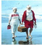
Santa & Mrs. Claus' last day of vacation before preparation for Christmas.

The Marine Toys for Tots Foundation enjoys one of the very best program-to-support ratios within the nonprofit world — 97:3! This means that over 97% of your donation goes directly to our mission of providing toys, books and other gifts to less fortunate children. The 3% spent on support principally covers fundraising expenses — not one donated dollar goes to salaries or any manpower costs!