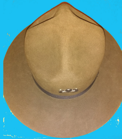
Marine Parachutist or Paratrooper Manufactured by Stetsen