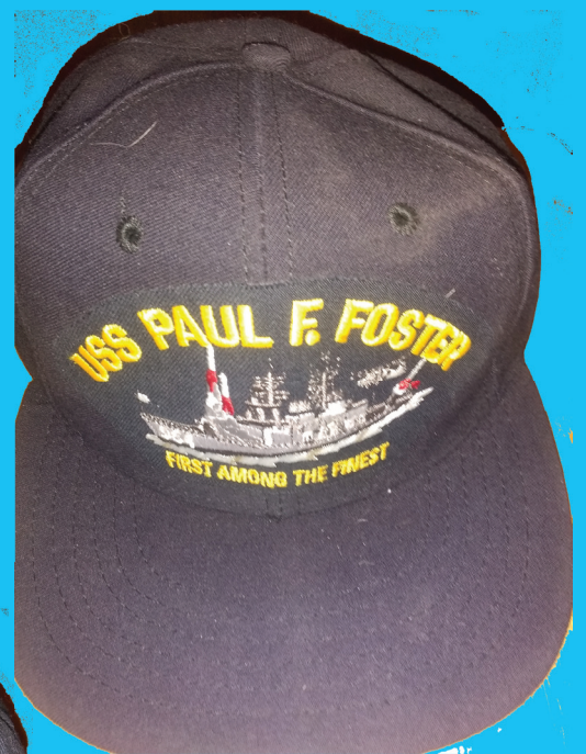
USS Paul F. Foster