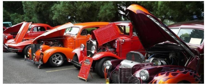
David Palmer Photography