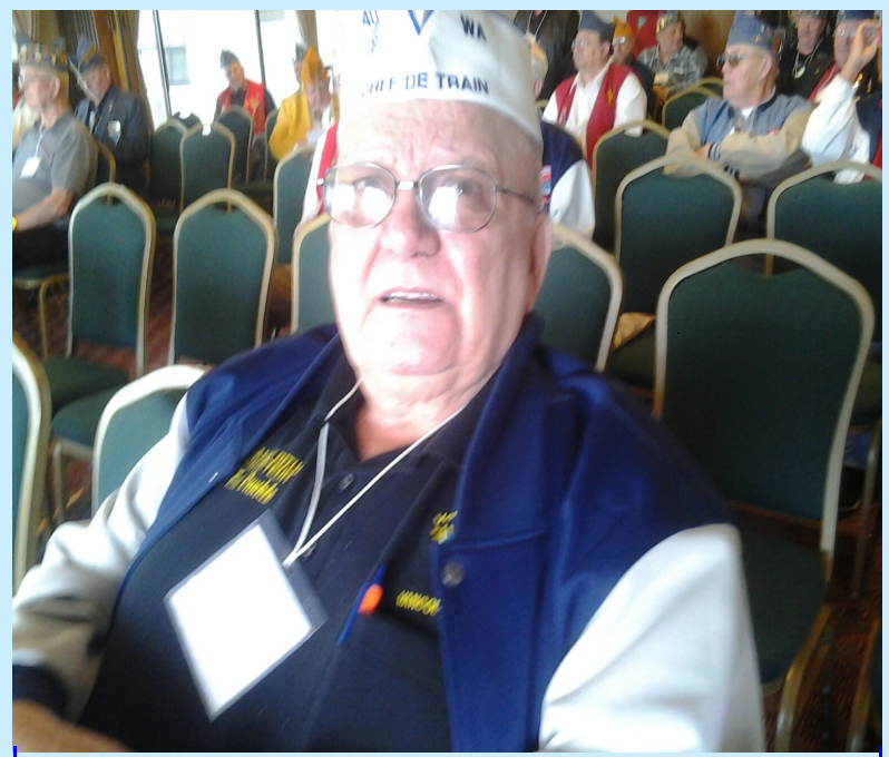
Our most honorable Grande Chef de Tran waiting for the Great Western to begin.

Voyageures attending the Grande Cheminot on April 10 - 11.