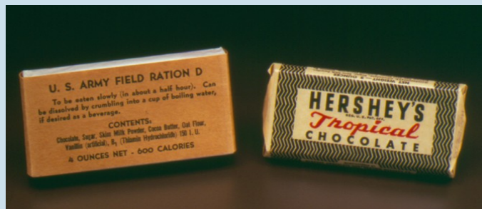
Ration D bar and Tropical Chocolate bar, 1942-1944

ceeding all production expectations in the manufacturing of an Emergency Field Ration. An honor not easily won nor lightly bestowed, this wartime honor recognized companies that consistently met high standards of quality and quantity in light of available resources.