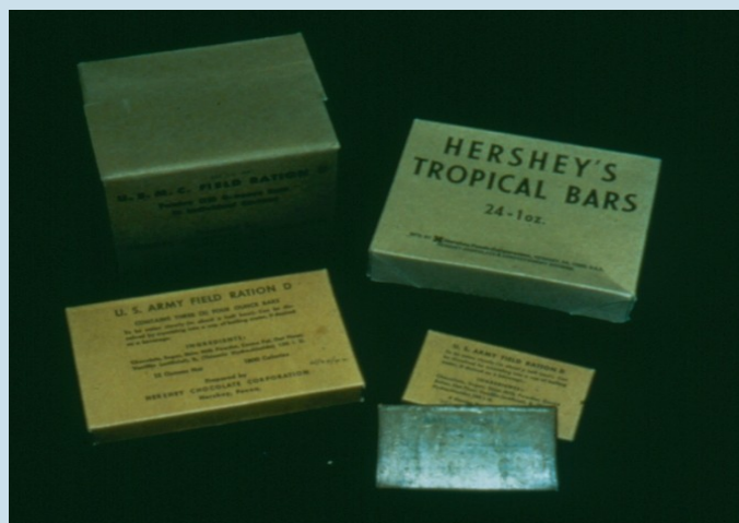
Packaging for the Ration D bar, 1942